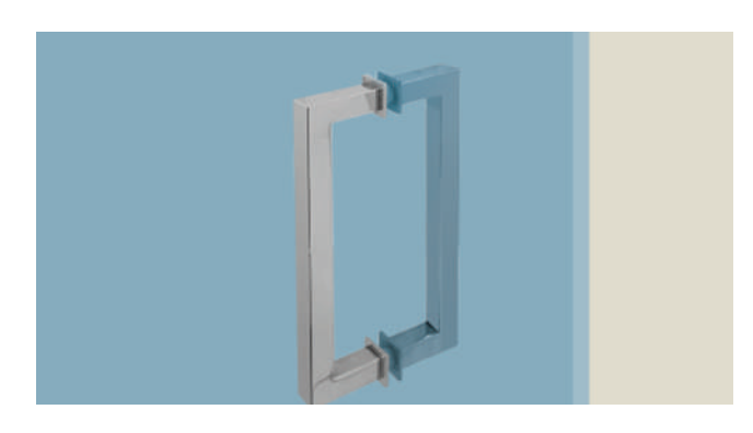
Door handle (double or simple)