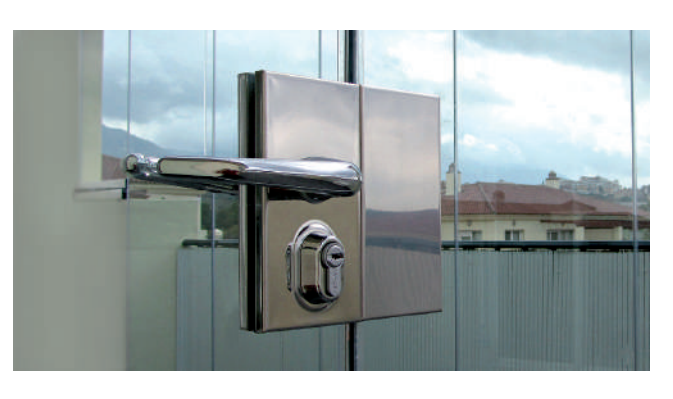
Glass installed lock (Crank)